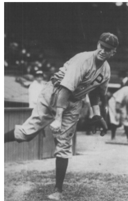
Grover Cleveland Alexander

The most important lawsuit involving the Federal League and the senior circuit, however, was one that was ultimately dismissed on consent of the parties. In January, 1915, the Federal Baseball League filed a complaint against Organized Baseball in the United States District Court for the Northern District of Illinois and the future Commissioner of Baseball, Kenesaw Mountain Landis, was assigned to the case. The complaint alleged that Organized Baseball constituted a combination, conspiracy and monopoly in violation of federal antitrust laws. Representing Organized Baseball in this litigation was George Wharton Pepper, seasoned by his experience in the Killefer case. Pepper gives an account of this litigation in his autobiography: