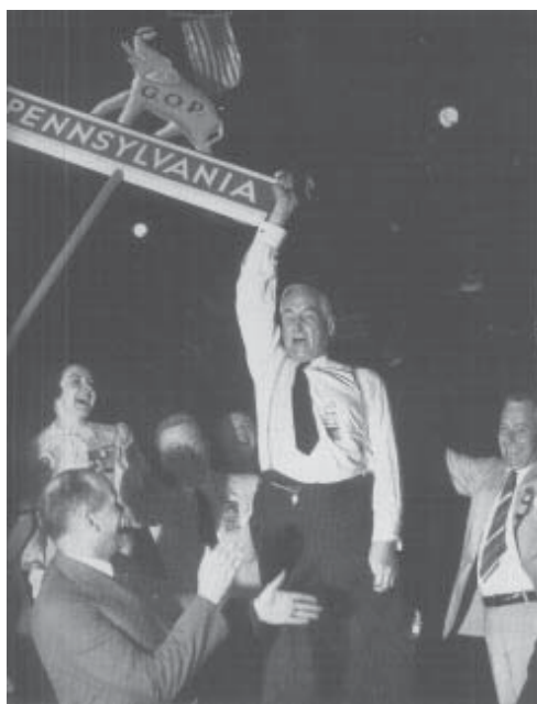
George Wharton Pepper, Attorney for Organized Baseball